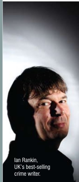
Ian Rankin, UK's best-selling crime writer.

Edinburgh's Literature Quarter The 'Literature Quarter' is right in the heart of the Old Town and encompasses the Scottish Poetry Library, Scottish Storytelling Centre, Scottish Book Trust, Canongate Books, The Writers' Museum, Makars' Court and the National Library of Scotland.